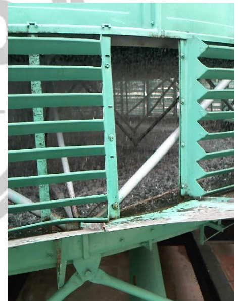
Cooling towers at the Lisboa Hotel, Macau – Kiko Technology yields annual savings of more than 60 times the cost of investment with no added maintenance fees.